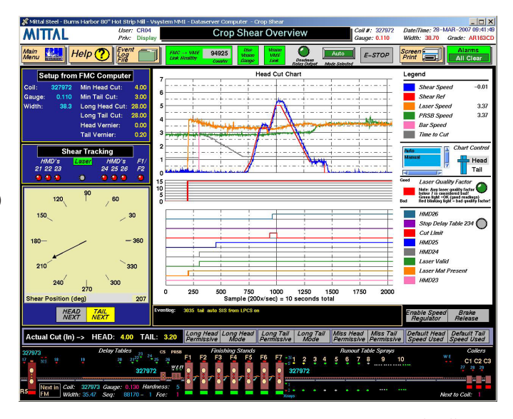
Steel mill screen

The flexibility offered to users by the depth of Vsystem ensures that unexpected requirements of a